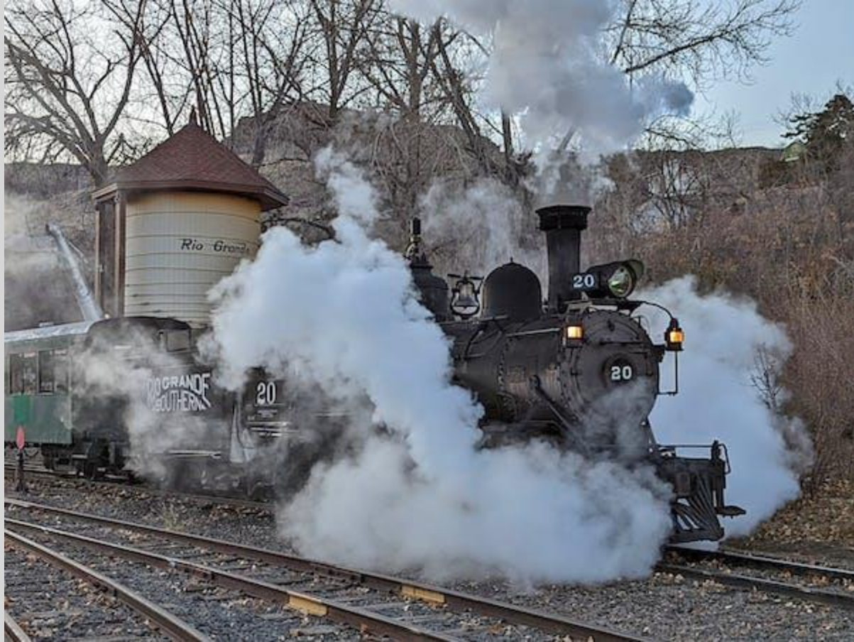
Rio Grande Southern #20 under steam at the Colorado Railroad Museum, Golden, CO.