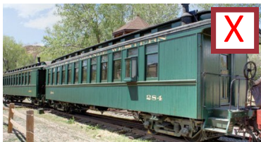
PASSENGER CAR OR COACH